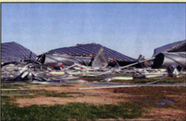
Photo H— An EF2 tornado destroyed grain bins along Arkansas Highway 88 at Sweden in Jefferson County, Arkansas.