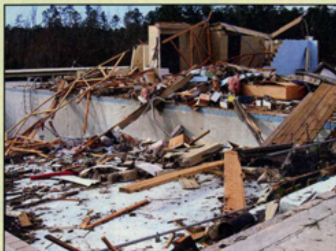
Photo G— Much of the bathhouse at the Fordyce Country Club was blown into the pool.

Damage: Lonoke County: Irrigation pivot flipped over, landing in nearby ditch. Tree limbs snapped off.