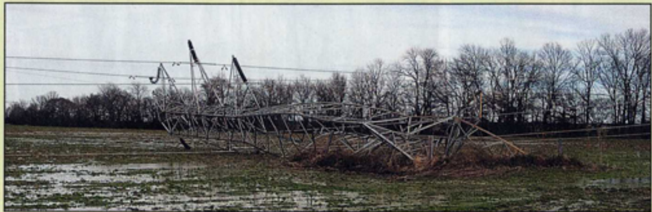
Photo I— A large electrical power line transmission tower lies on its side in Arkansas County after storms ravaged the area.