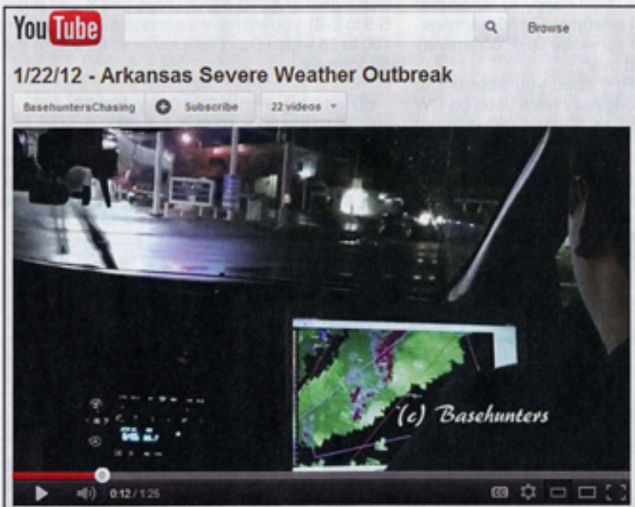
Photo F—A video posted on YouTube by Basehunters storm chasers shows the unpredictability and confusion that accompanies severe weather, especially when it occurs at night: http://bit.ly/xHyVoS .