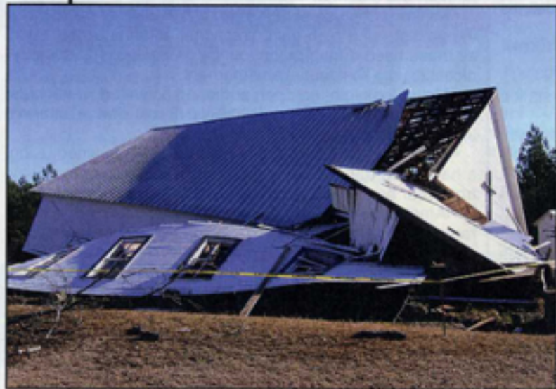
Photo A—A church built in 1852 and 2.8 miles west-northwest of Kingsland in Cleveland County, Arkansas, was leveled when an EF2 tornado (winds 111–135 mph) tore through the region in January.

*1940 Wetherly Way, Riverside, CA 92506 e-mail: < ki6sn@cq-amateur-radio.com >